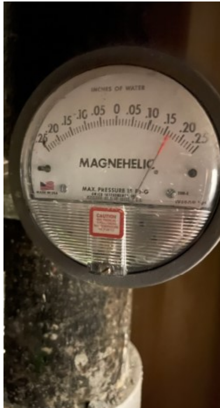
Photo 3 - View of Riser 4 gauge.