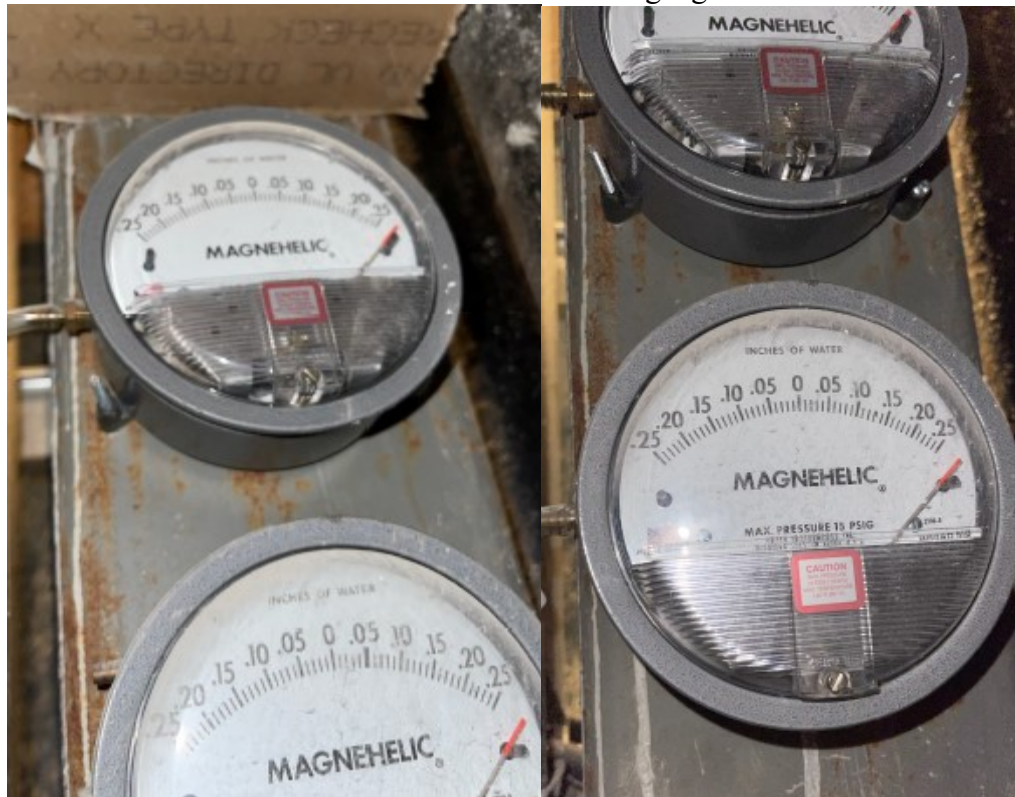
Photo 4 & 5 - View of Riser 2 and 3 gauges.