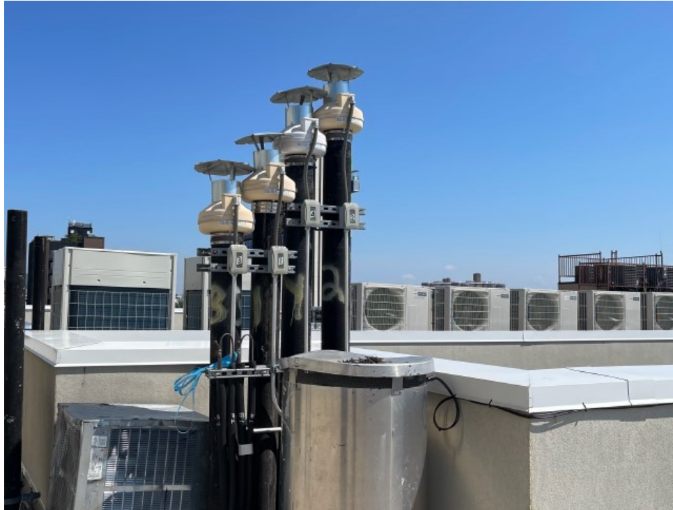
Photo 6 - View of riser exhausts on roof.