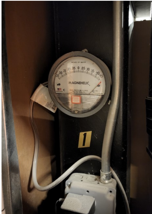
Photo 1: View of Riser 1 alarm and gauge cabinet at 801 Bedford Avenue, Brooklyn, NY.