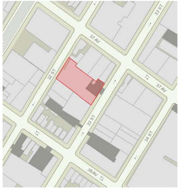
Figure 2 – Site Map