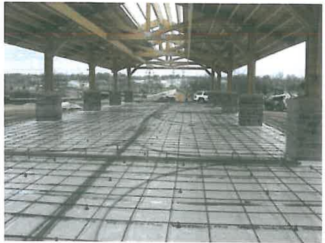
Under-Slab Vapor/Gas Retarder

VaporBlock® Plus™ 20 is available in 10' x 150' rolls to maximize coverage. All rolls are folded on heavy-duty cores for ease in handling and installation. Other custom sizes with factory welded seams are available based on minimum volume requirements. Installation instructions and ASTM E-1745 classifications accompany each roll.